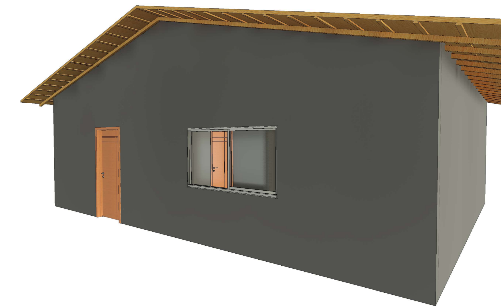
3 Vista 3D 1